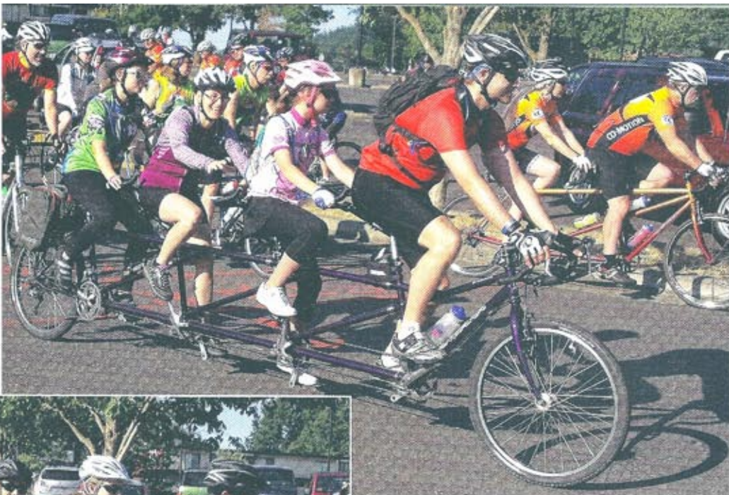
Quads were not an uncommon site among the 400+ tandems enjoying the Northwest scenery and hospitality. The Co-Motion team gets extra points for the (almost) matching kit.

The Sunday routes, short/medium/long, showcased famous Chuckanut Drive, some of the most spectacularly scenic riding in the Northwest. Medium and long riders also