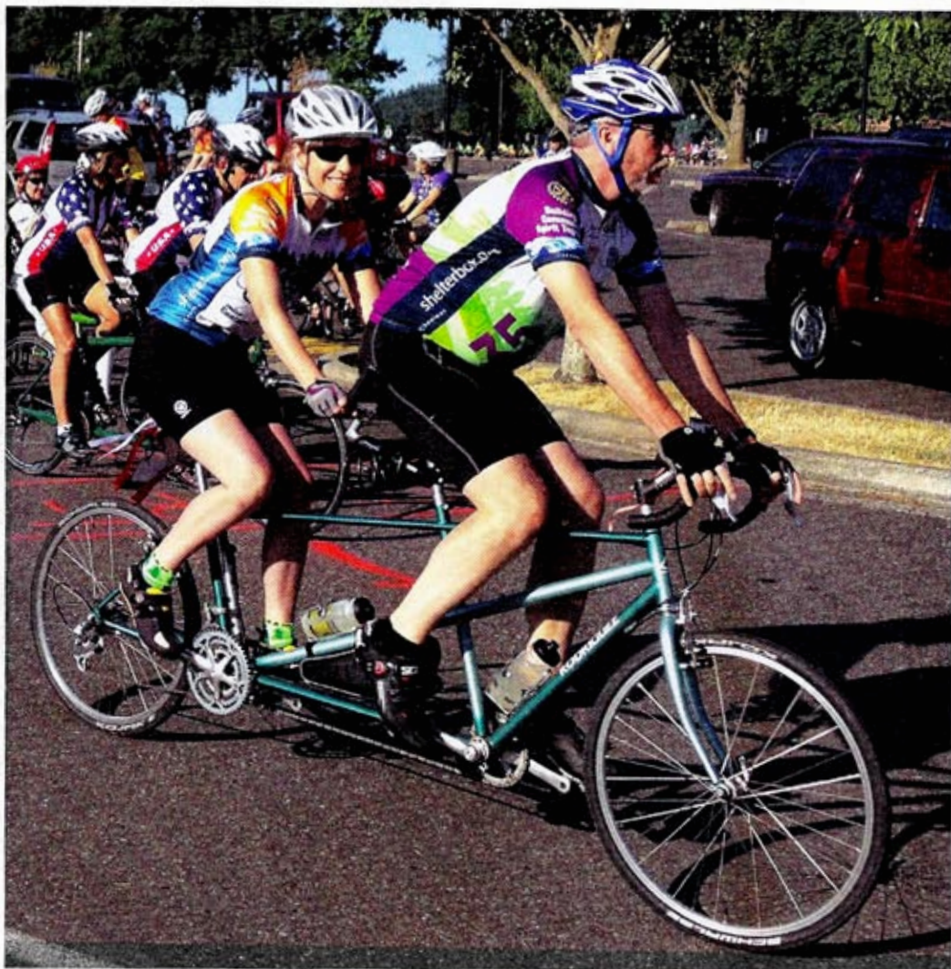
A beautiful example of a custom-built Rodriguez tandem glides by the photographers lens during the 2015 NWTR.

for that specific prize. The raffle drawing was held just before the banquet (the drawings for the biggest, most valuable prizes were held on